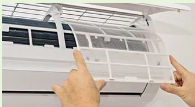
Ductless Heat Pump