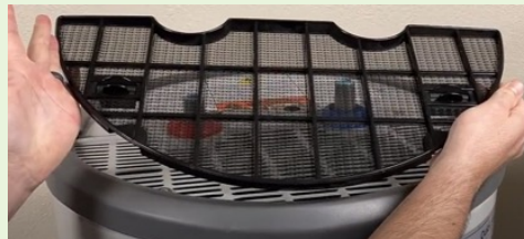
Heat Pump Water Heater