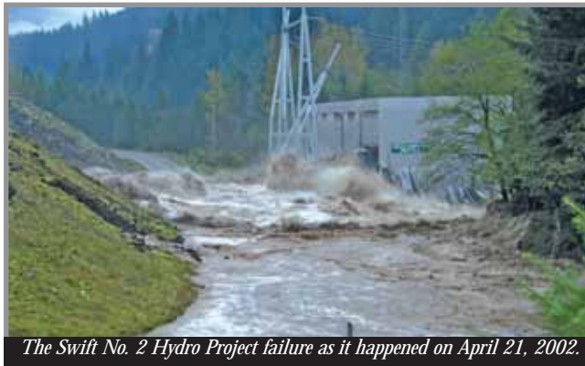
The Swift No. 2 Hydro Project failure as it happened on April 21, 2002.

Cleanup and reconstruction work at Swift No. 2 was completed at the end of 2005 at a cost of about $135 million, which included the cost to purchase replacement power while the project was shutdown for nearly four years. The TIG payment brings the PUD's net insurance proceeds to about $100 million, with the balance of the repair cost